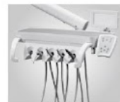
The injection molding tool tray is simple and generous, with high temperature resistant protective pad