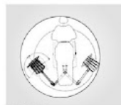
左右手操作 旋转式拉杆，可左右手转动操作 Left-right hand operate