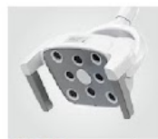
LED灯 LED LAMP