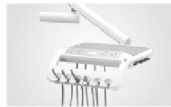
工具盘 工具盘 Luxury tool tray

独特设计外观, 拥有液晶状态显示屏, 按键式控制面板。 Down-mounted tool tray Unique design appearance, key-button control panel with X-film viewer.