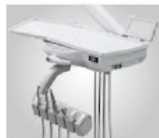
Swivel handpiece holder with five positions