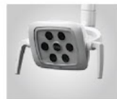
LED Sensor operation lamp