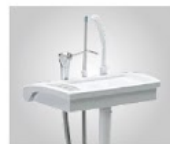
Movable controllable assistant device