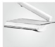
托盘 托盘 Tool tray