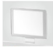
观片灯 Film viewer