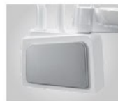
The unit box is designed for separation of water and electricity easy to