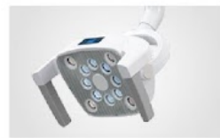
LED灯 12孔LED灯三种可感知光 3 type of light perception