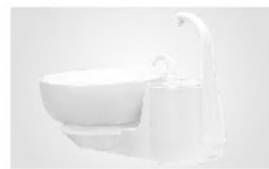
痰盂 可转动痰盂 Movable cuspidor