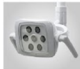
LED Sensor operation lamp