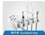
助手架 Assistant tray