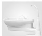
90°移动托盘 可拆卸托盘，清洗方便卫生 removable option it is easily cleaned and hygienic