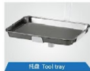
托盘 Tool tray

Well-design top-mounted tray, easy to operate.