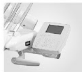
工具箱 选购件下托工具箱 option Luxury tool tray