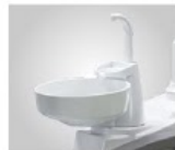
Movable melamine spittoon