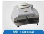
脚踏 Foot pedal